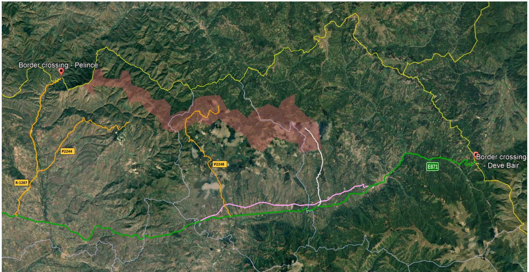
Figure 3 Overview of the preliminary project scope, access roads and border crossings